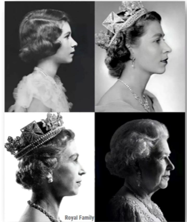
Pictured above: Four photos of Queen Elizabeth II, from childhood, to her coronation and celebrating 70 years as Queen

Queen Elizabeth II, April, 1947 on her 21 st birthday (5 years before becoming Queen).