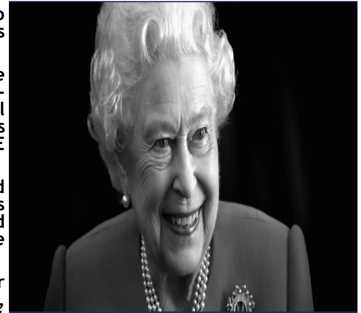
Queen Elizabeth II 1952–2022