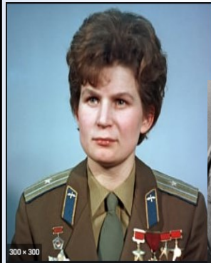
Valentina Tereshkova was the first female in space.