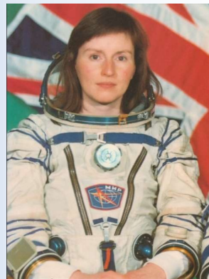
Dr. Helen Sharman. Britain's first astronaut

Valentina Tereshkova – First female in Space