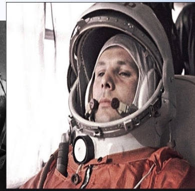
Yuri Gagarin was the first man to orbit Earth